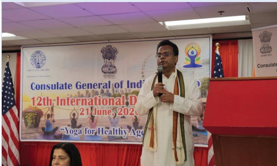
India's Consul General in Chicago Somnath Ghosh addresses the crowd at the National India Hub, for IDY 2026 celebration June 21, 2026.