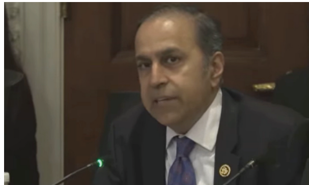
Congressman Raja Krishnamoorthi, D-Illinois, speaking on the issue of naturalized citizens being barred from federal public office and appointments.