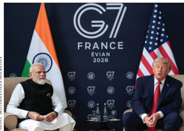
U.S. President Donald Trump attends a bilateral meeting with Indian Prime Minister Narendra Modi during the G7 Summit in Evian-les-Bains, France, June 17, 2026.

U.S. Secretary of State Marco Rubio visited India last month seeking to repair ties, but the killing of three Indian sailors in attacks on commercial ships by the U.S.