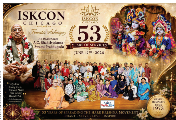
Celebration of 53 years of the ISKCON temple in Chicago, June 17, 2026.

Senior devotees shared vivid recollections of the early years of Krishna consciousness in Chicago. Memories were recounted of the temple's humble beginnings in a small apartment on Halsted Street, followed by its move