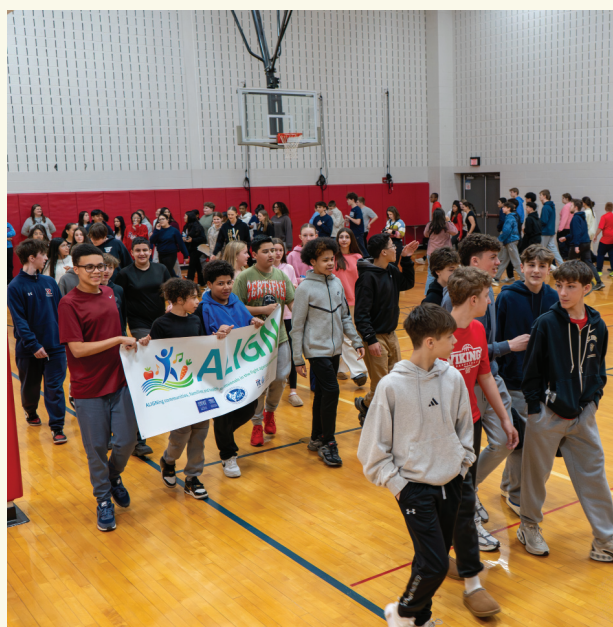
ALIGN Health Initiative event held at Riverside High School in Scranton, PA, on March 27, 2026.