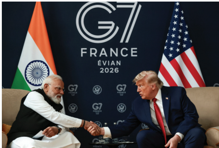
U.S. President Donald Trump attends a bilateral meeting with Indian Prime Minister Narendra Modi during the G7 Summit in Evian-les-Bains, France, June 17, 2026.

The White House had earlier confirmed that the meeting would focus heavily on advancing the proposed India-US trade agreement. Earlier sources also said that