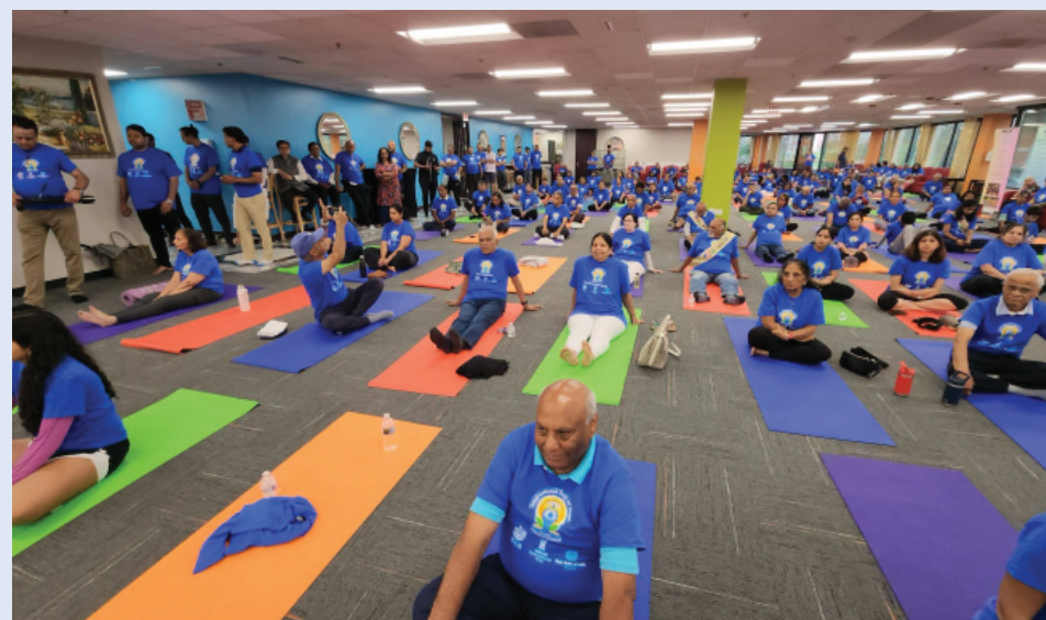
Hundreds joined in Yoga celebrations June 21, 2026 in Schaumburg, Illinois, for International Day of Yoga.