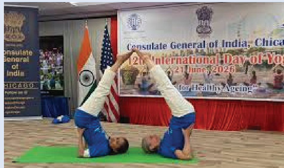
Two youth show yoga postures at the June 21, 2026 IDY celebrations in Schaumburg, Ill.

The Consul General praised National India Hub and its leadership for making the venue available at short notice after