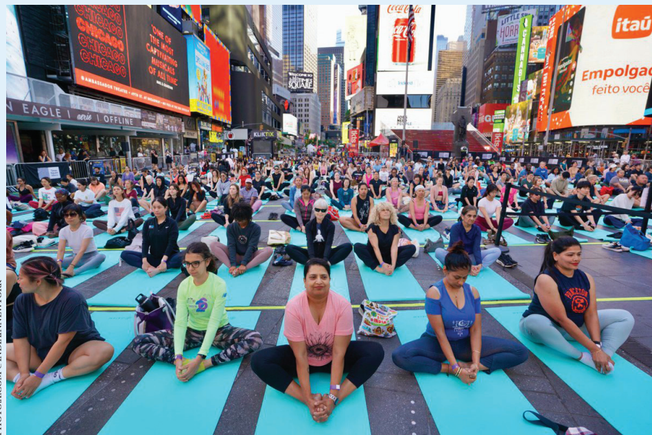
Yoga practitioners and learners do the asanas at Times Square June 21, 2026.

The iconic Times Square popularly called “the crossroads of the world” resonated with chants of “Om” as hundreds of yoga enthusiasts, members of the Indian diaspora and wellness advocates gathered to celebrate the International Day of Yoga June 21, highlighting the growing global appeal of the ancient Indian practice. The theme of this year’s celebration was “Yoga for Healthy Ageing”.