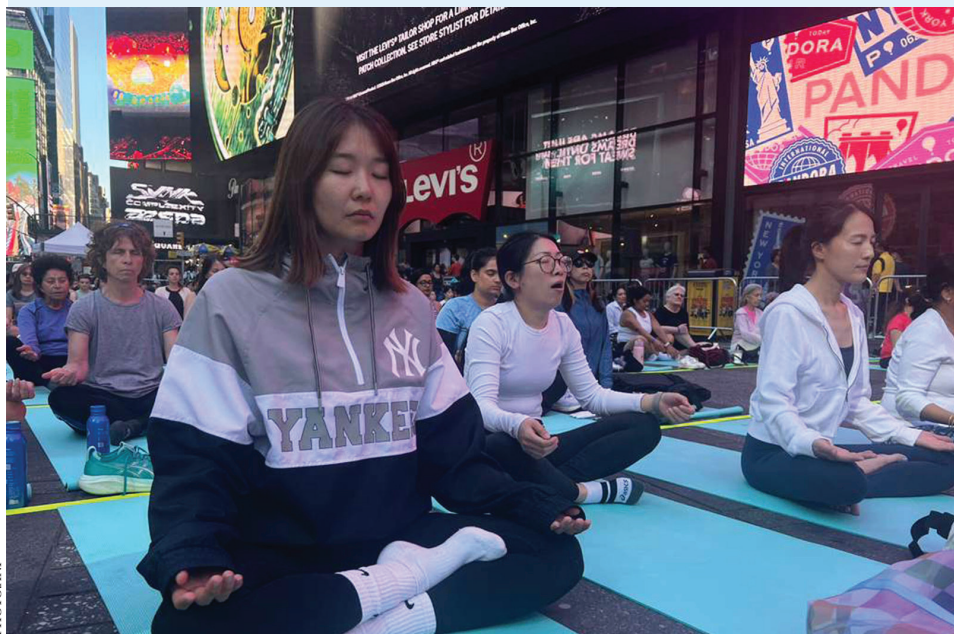
Yoga enthusiasts gathered at Times Square, NYC, to observe the 12th International Day of Yoga, IDY, held June 21, 2026.