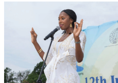
Above and below: Yoga instructors guiding the participants on IDY 2026, in Washington, D.C. June 19, 2026.

in collaboration with community-based organizations.