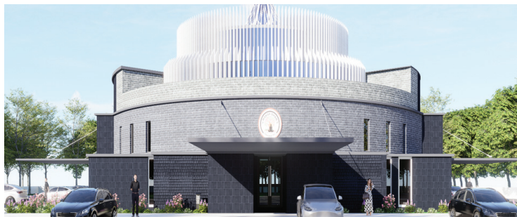
MOKSH DHAM Cremations Inc., A Sanatani Community Project

The organization plans to offer a comprehensive range of services, including qualified priests to perform religious ceremonies at minimal cost, professional staff to guide families through every step of the process, rental caskets with disposable containers to help reduce expenses, return of cremated remains with all required